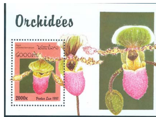
Stamp sheetlet of Paphiopedilum chamberlainianum syn Cypripedium chamberlainianum

In the Gardeners' Chronicle of 13 February 1892, Frederick Sander described both Cypripedium victoria-regina and C. chamberlainianum . After much deliberation it was deemed that both descriptions were identical. The description of C. victoria-regina was detailed but of C. chamberlainianum it was said, that it had 'violet - purple and white' flowers 'growing all along the spike' and leaves '2 feet long and 2 inches wide and all mottled'. The description by Sander was later considered inadequate and consequently, the registration of C. chamberlainianum was not accepted as valid.