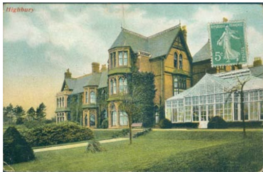
Highbury with glasshouses to the side.

Joseph Chamberlain became interested in orchids about 1877, at the time of building his home, 'Highbury' at Moor Green, on the outskirts of Birmingham.