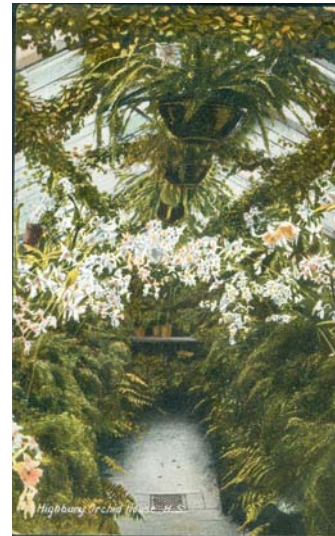
Orchid glasshouse at Highbury