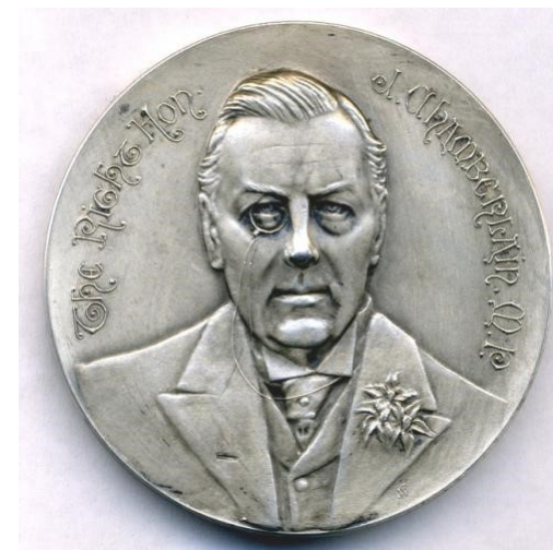
Medal struck for Chamberlain's visit to South Africa

On the 31 st May 1902 he wore a beautiful white Odontoglossum with a gold centre, chosen to celebrate the capitulation of the Boers. Joseph Chamberlain visited South Africa from the 26 th December 1902 until 25 th February 1903, where he was warmly received. His intention was to promote Anglo-Africaner conciliation following the Boer War. One of his most appreciated, of many presentations during his visit, was a bouquet of Transvaal orchids. Upon his departure he was presented with a large plant of Ansellia africana syn gigantea .