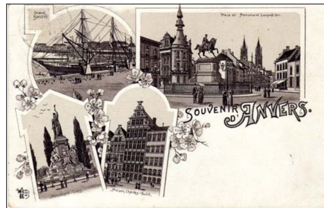
Beautifully lithographed card postmarked from Antwerp in 1894.

The detail below shows enlargement of part of one of the panels