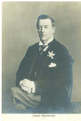
Joseph Chamberlain with orchid in lapel

When the Chamberlain family was in London, a box of the most beautiful blooms was sent every week for the decoration of their Princes' Gate house. In addition, two orchids, suited for placing in the buttonhole, were sent every day from Moor Green, Birmingham to London when Mr. Chamberlain was sitting in the House of Commons. Chamberlain held cabinet posts in the British Government from 1880 to 1903 and was during that time in contention for the position of Prime Minister.