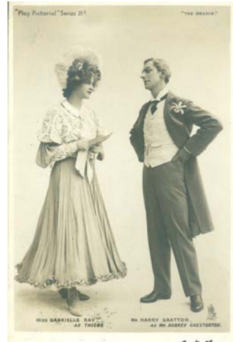
Scene from stage production "The Orchid"

Besides satirical postcards depicting him as an orchid., Chamberlain was parodied by a thinly disguised Mr Aubrey Chesterton in a musical comedy, 'The Orchid', that was performed at the newly renovated Gaiety Theatre, West End in 1903. Here Mr. Aubrey Chesterton is in pursuit of a rare orchid brought from the 'jungles of Peru'.